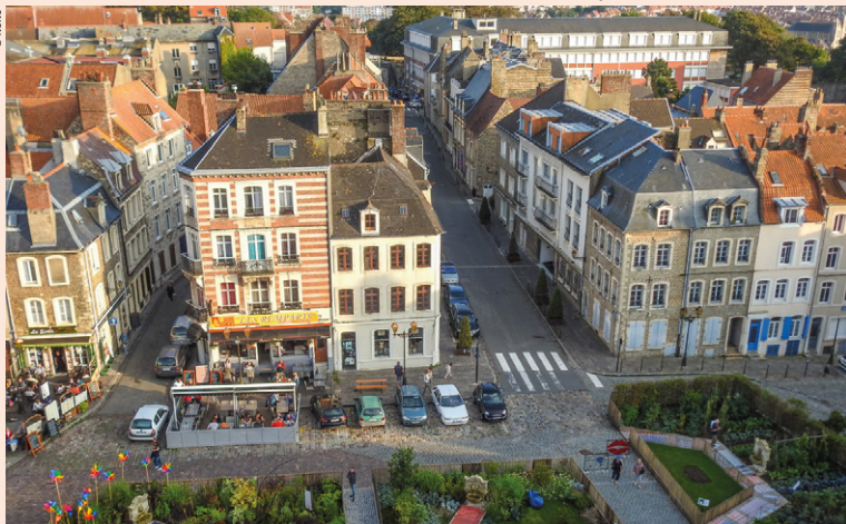
Boulogne-sur-Mer city centre.