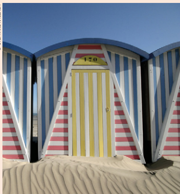
Beach cabins in Dunkerque.