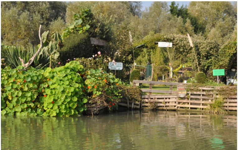
The gardens of Marais Audomarois are famous, Saint-Omer.

► The beach of Audresselles. It is not a beach but two, which is offered by the authentic fishing village. Separated by the cape called "Côte-de-Fer", the two neighbors are quite different. The southern beach, suitable for bathing, stretches to Ambleteuse. The northern beach, meanwhile, stretches to Gris-Nez and has a much wilder face. Furthermore, it is not monitored and remains unadvisable for swimming. In this site, you may have the chance to watch the departure of flobarts, these fishing boats typical of the coast.