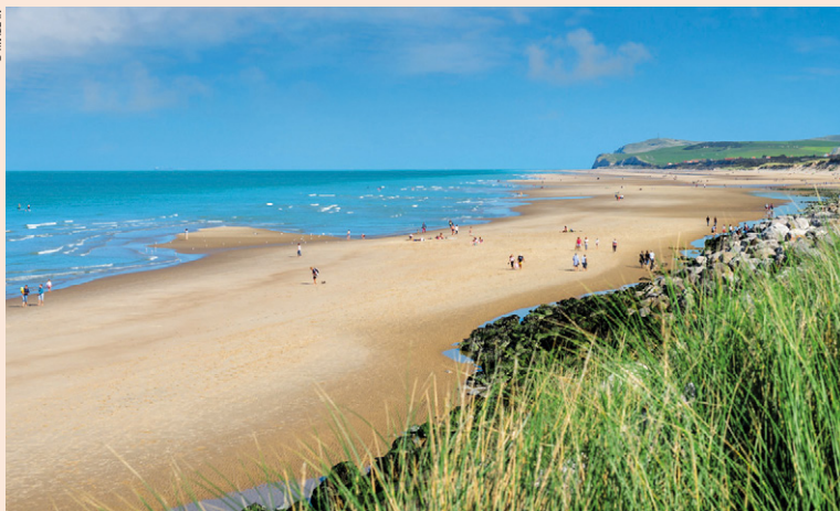
Wissant beach and its visitors.