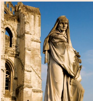
"Statue Suger", representing the abbot Suger (1081-1151) in front of the ruins of the benedictine abbey of Saint-Bertin, in Saint-Omer.