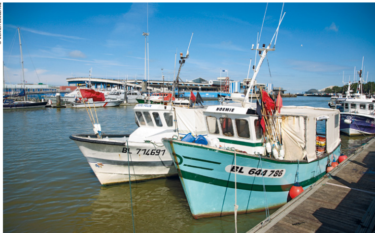
The flotilla of artisanal fishing, Boulogne-sur-Mer.