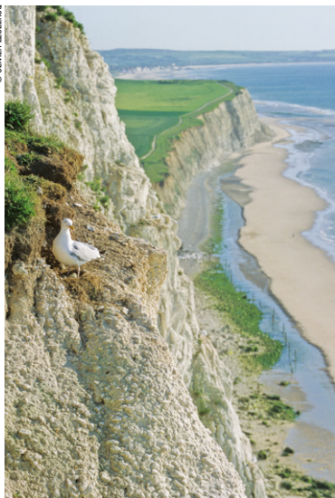
The site of Deux Caps houses two hundred and fifty bird species, Escalles.

Located between Berck and Le Touquet, on 26 ha of nature, Bagatelle offers more than 40 surprising attractions, which promise to share with family or friends convivial moments in a warm atmosphere.